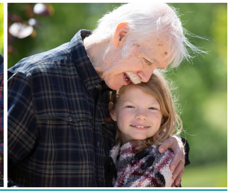
A Beautiful Day Celebrating with Friends and Family